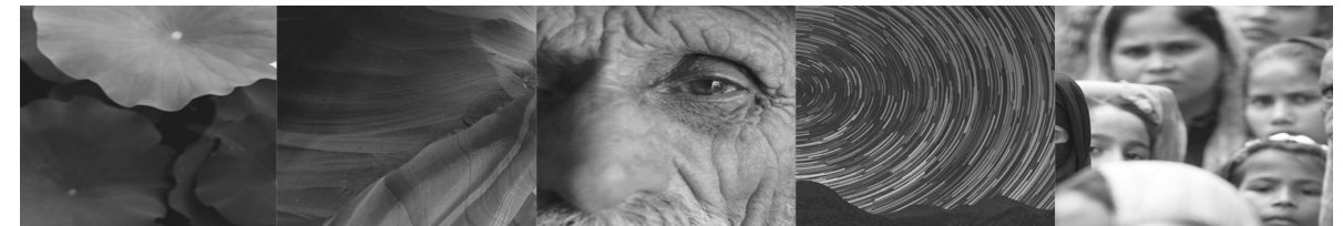
2017 LOTTIE MOON CHRISTMAS OFFERING®

No, the thing that makes this year better than all other times of the year is that we get to stop from our busy lives and remember that we are celebrating because our Lord stepped down off of His throne to come and live amongst us to provide salvation to us. As you carry on in your busy life and participate in all of the things mentioned above, make sure that you are focusing on Jesus Christ. And what would make it even better is if you could tell someone else about Jesus so that they too could focus on Him and make Him the Lord and Savior of their life. Let’s celebrate Jesus in all that we do.